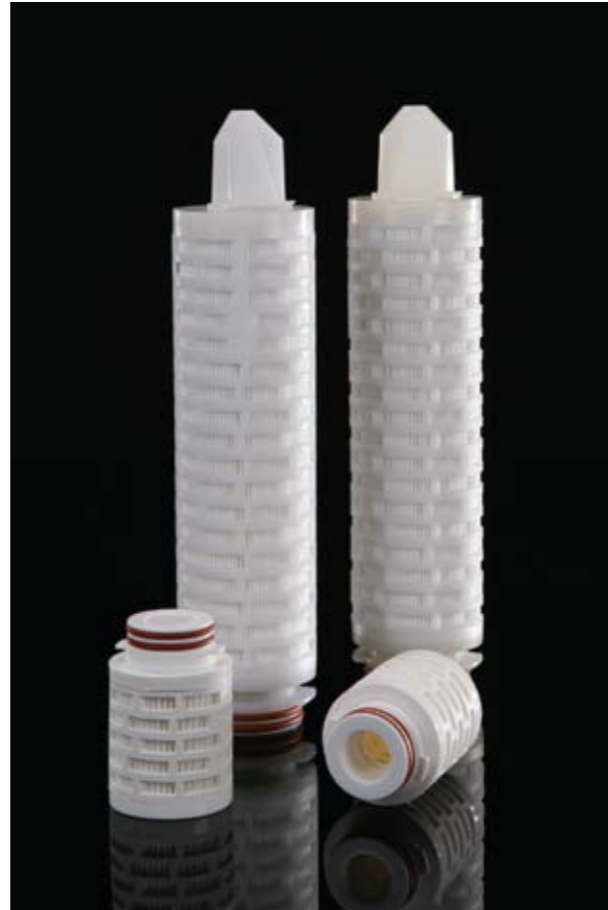
Note: TETPOR is a registered trademark of Parker domnick hunter